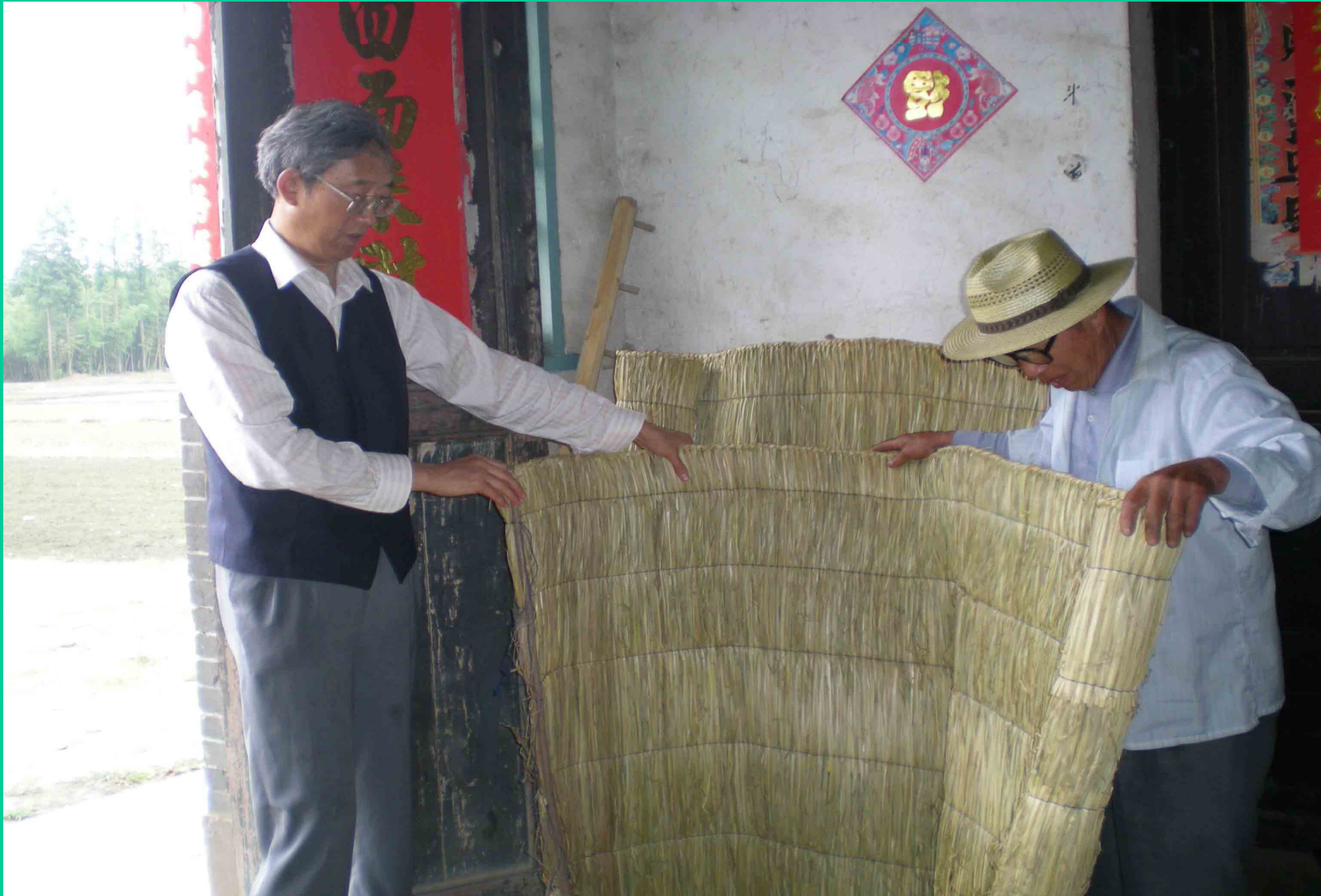
Cushion produced by local farmers