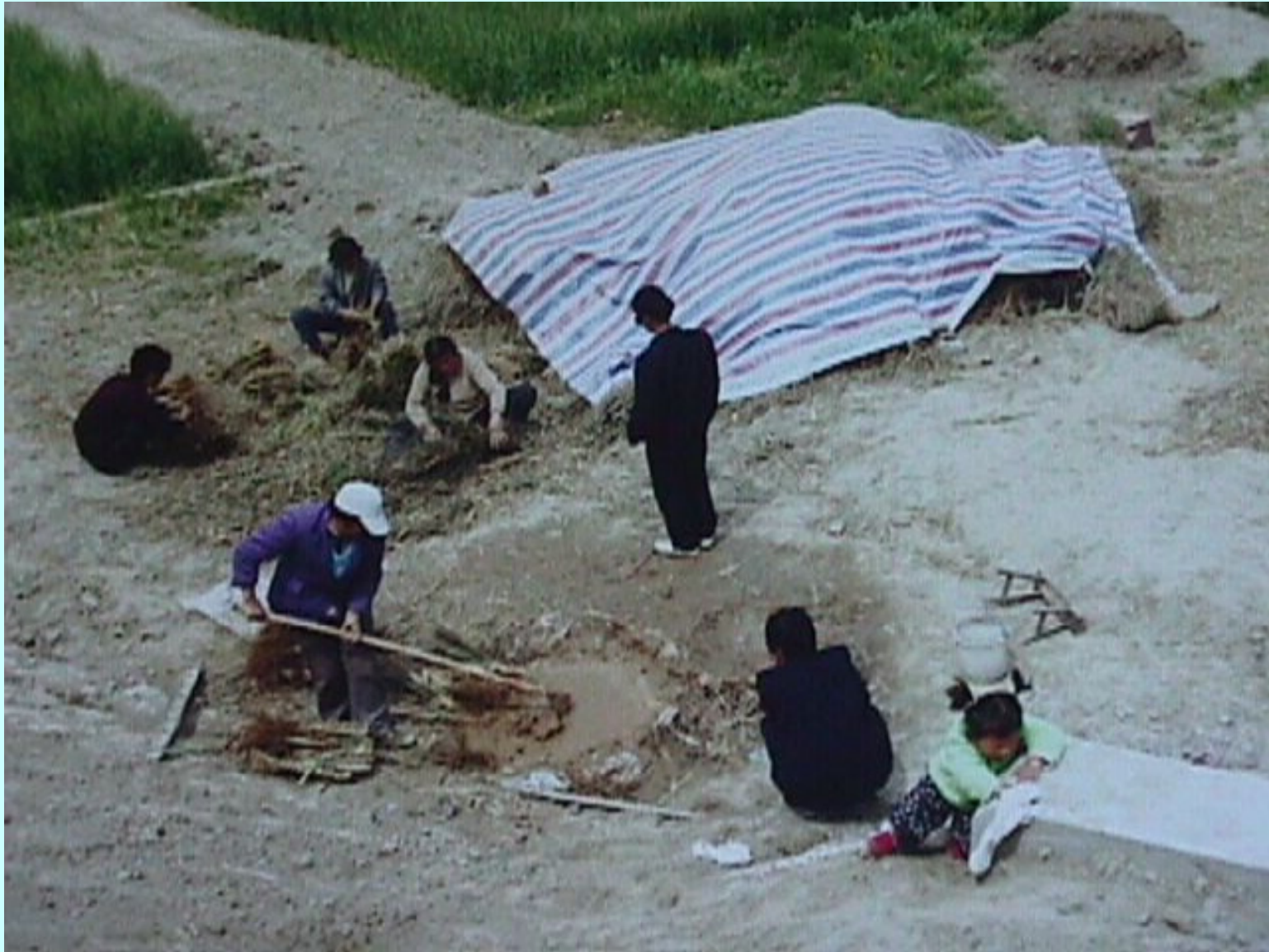
Farmers contract railway protection