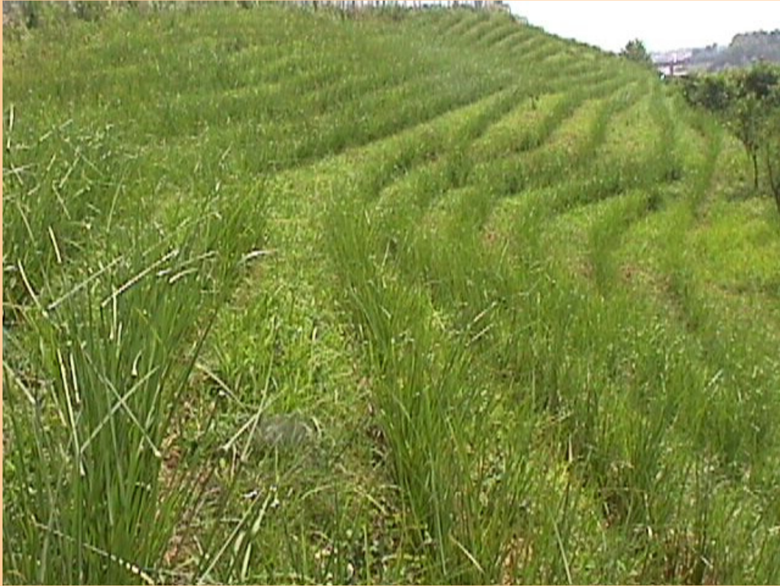
National Highway 312