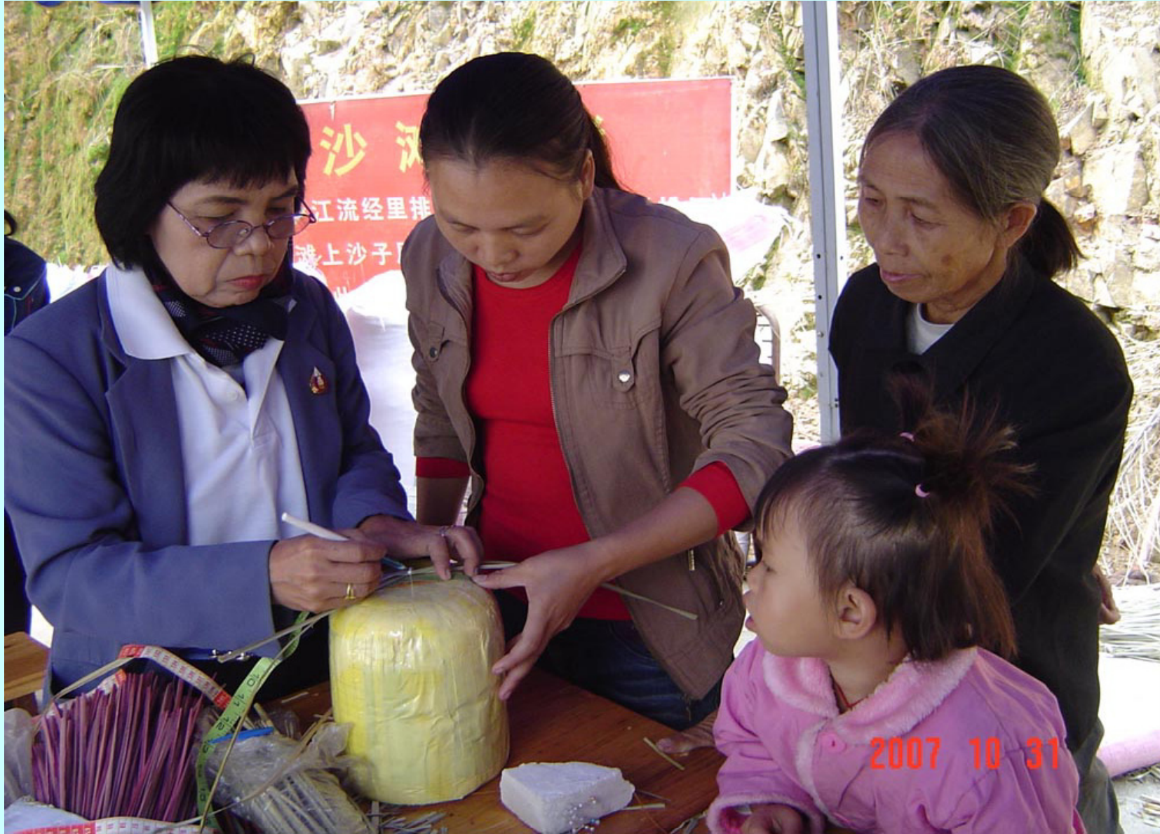
The old woman (right) saying: If I were younger!