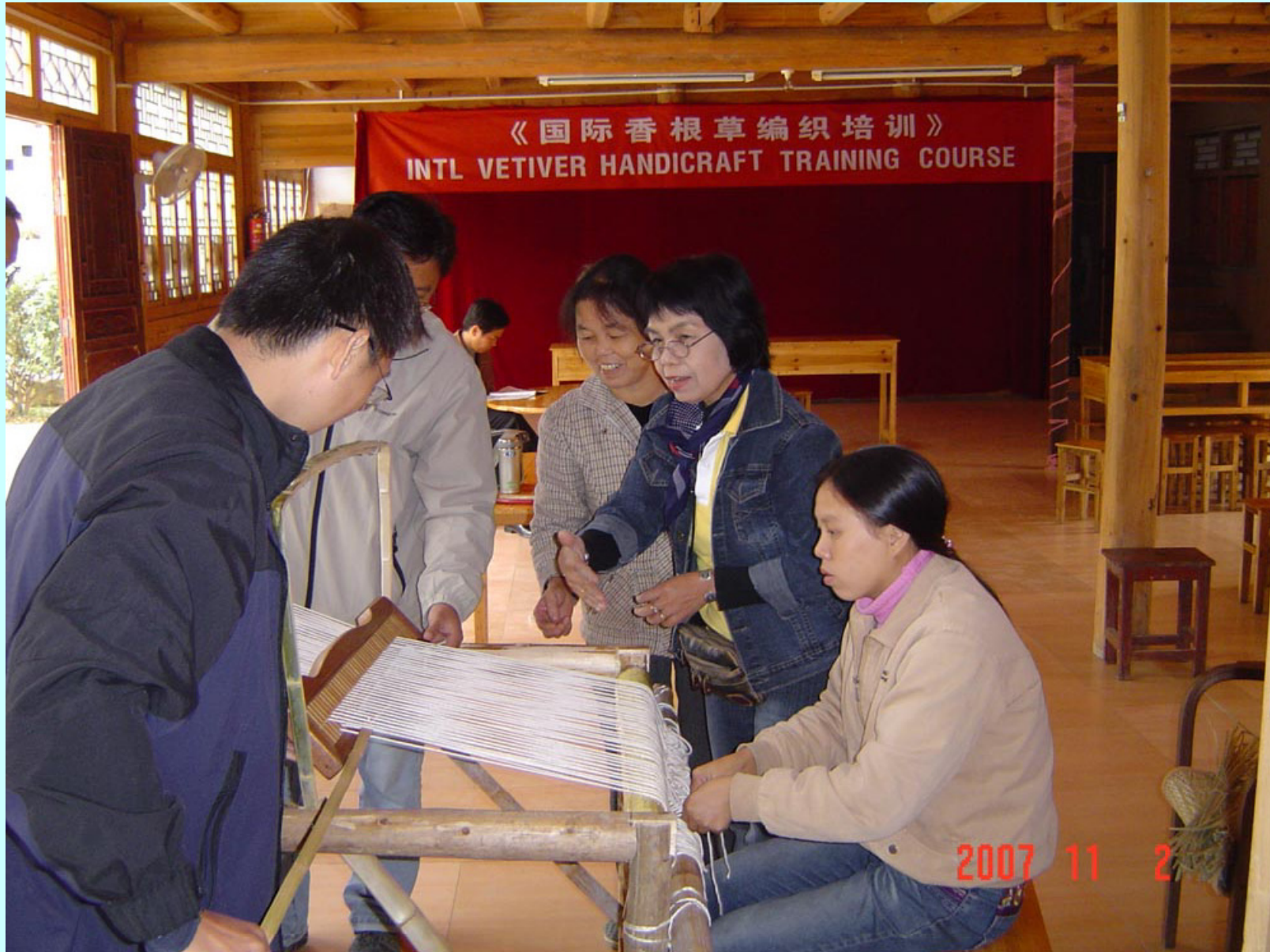
Learn to make mat