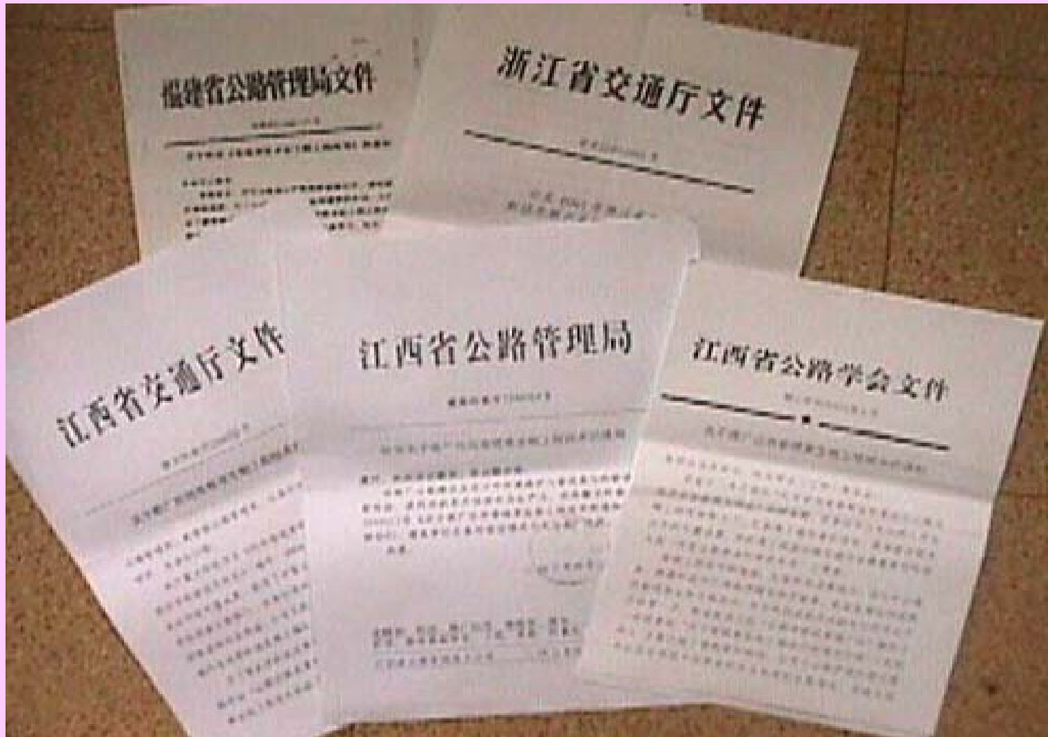
Official documents released by highway authorities — Highway Door Open