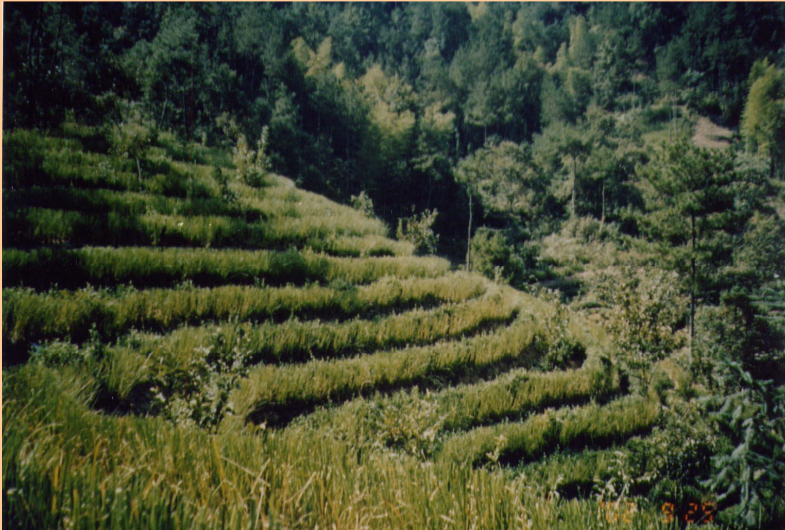
Vetiver protected tea trees in the Dabie Mountain